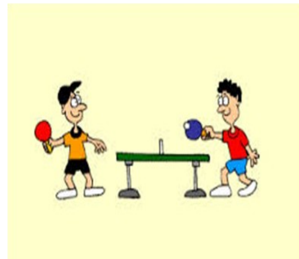
Table Tennis Section