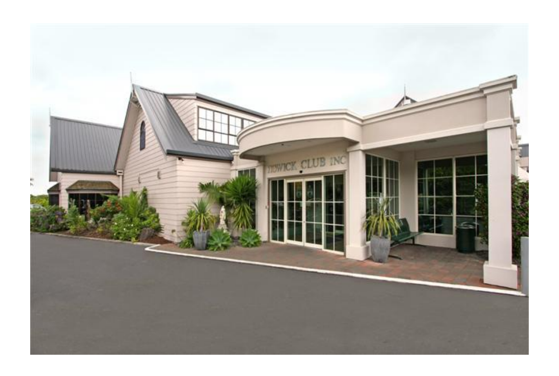
Opened in December 1984